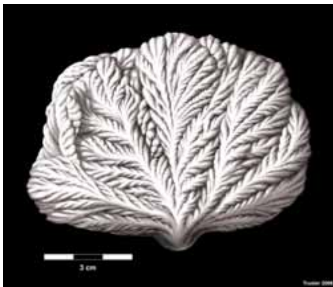
Figure 1. Bradgatia from the Neoproterozoic of Newfoundland, an early rangeomorph Ediacaran.

Our methodology involves Trusler working directly on site, analyzing the excavation environs as well as fossil collections. The final synthesis of geological, taphonomic, and morphological