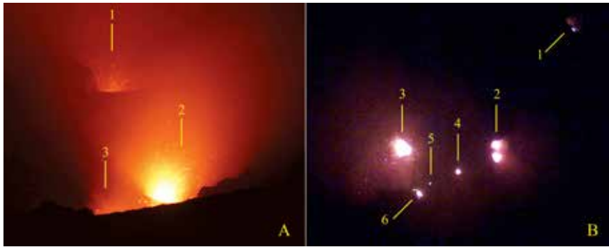
Figure 2. View of from crater rim of Mount Yasur Volcano. (A) From the rim, only three vents are visible. (B) From a micro-UAV image taken directly over the crater, six vents (1–6) are apparent (vents 1–3 correlate with the same numbered vents in [A]). It is also possible to see that vent 2 is obstructed.

One example of the benefits of using a micro UAV in the field comes from the 2014 field season at Mount Yasur Volcano on Tanna Island, Vanuatu. A UAV was flown directly over the active vents and within the gas plume of the volcano. Observations from the rim of the main crater found that there were three active vents emitting lava (Fig. 2). However, an analysis of the video and photographs collected from the UAV indicated that there were actually six active vents—three large vents and three smaller ones. It was also evident that the most active vent was partially obstructed. In addition, the ability of the UAV to fly directly into the gas plume makes it a safe and valuable platform for collecting samples of volcanic gas (cf. Shinohara, 2013).