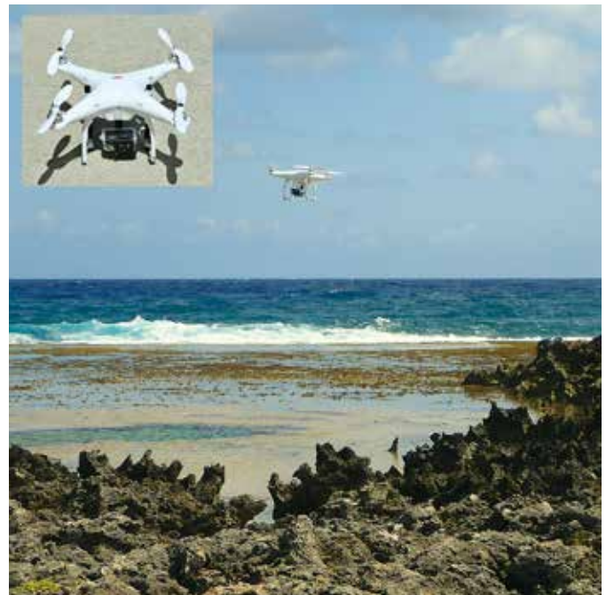
Figure 1. An example of a micro UAV, a DJI Phantom 2. The drone has a GoPro camera mounted between the landing gear.

UAVs provide access to areas that are hard to reach and/or dangerous, such as vertical or overhanging rock outcrops or gas-rich and unstable volcanic areas (Fig. 2) (e.g., Ohminato et al., 2011). They can be used to survey or map disaster areas during and after events, such as flooding or mass wasting (e.g., Delacourt et al., 2007; Niethammer et al., 2012). They have already been used for such things as bathymetric and topographic mapping of river channels (Lejot et al., 2007), 3-D mapping of geologic structures