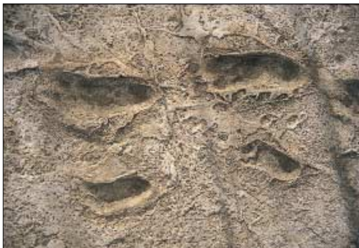
Figure 2. Hominid footprints at Laetoli, Tanzania. The origin of bipedalism, graphically illustrated here, still lies shrouded in the uncertainty of a gap in the fossil record. Further investigations may resolve the issue of whether this event is linked to global environmental change at the end of the Miocene.