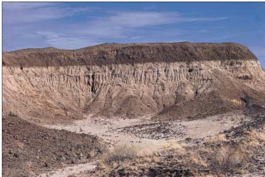
Figure 4. Fossiliferous sediments like this fluvial channel and overbank couplet at Koobi Fora in the Turkana Basin have yielded a detailed record of steps in hominid evolution and the environmental context in which it took place.

Two other questions remain to be answered. The first concerns how much of the continent provided the signal recorded in the marine dust records. Present-day dust flux off Africa is derived primarily from already arid regions around the Sahara, and Holocene variations have been attributed to shifts in the extent of that arid belt. The signals recorded in the marine dust record do not necessarily imply threshold changes in wetter habitats on the continent, and thus may not have directly affected organisms there. The impact of periodicities and their shifts must be directly measured in the environmental record of individual sites and basins associated with the record of hominid evolution in order to establish that link. The second question concerns the ability to discriminate among various interacting environmental factors and to uniquely identify climatic signals. While the large-scale response across northern Africa recorded by deMenocal (1995) calls for large-scale controls such as climate, when we begin evaluating the record directly associated with hominid evolution, more local- and regional-scale phenomena may obscure such signals. It is also important to consider that global climate in the Pliocene-Pleistocene