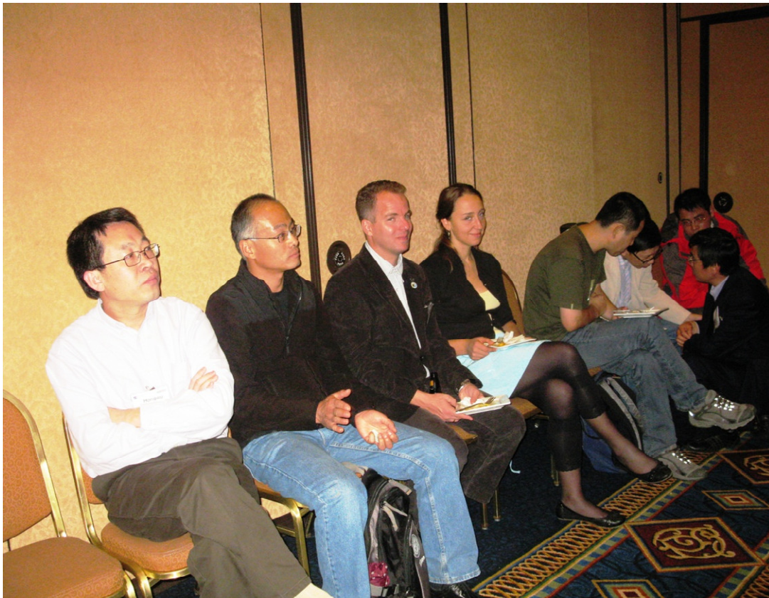
Photo 9: IS Reception and Happy Hour bringing international and local participants together