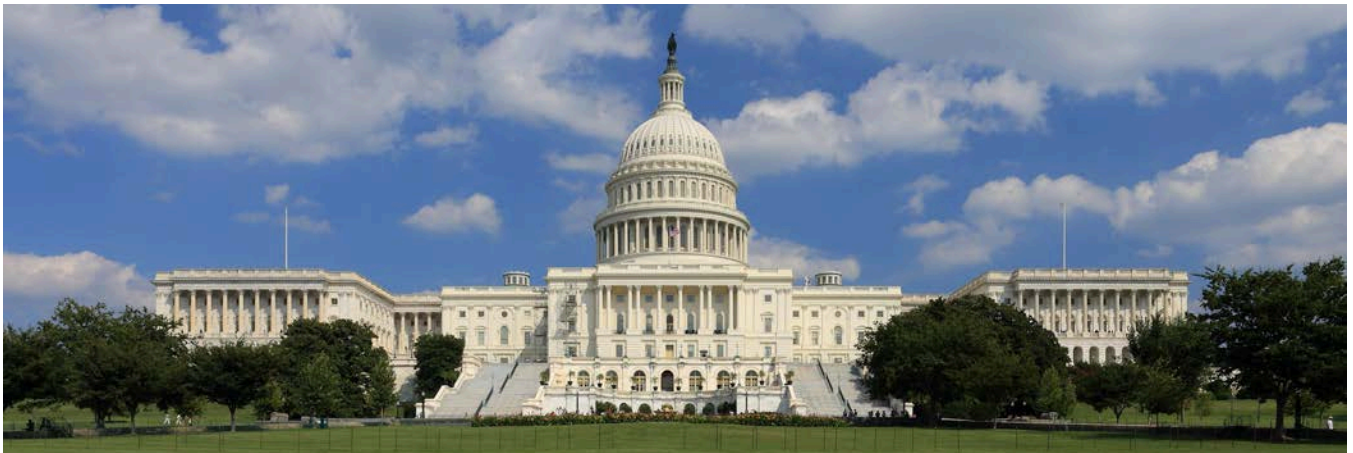
Photo of the U.S. Capitol Building, Washington, D.C.