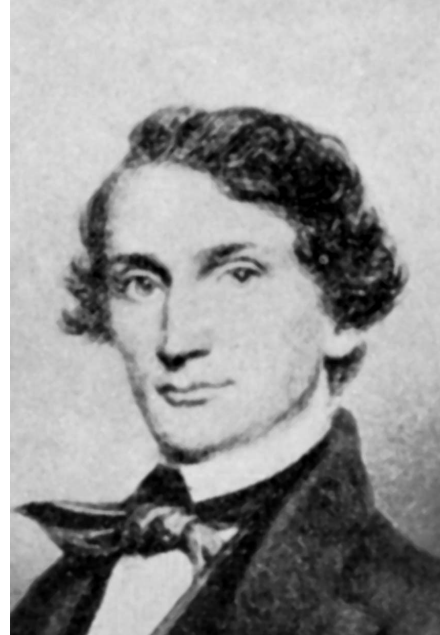
James Dwight Dana at the time when he was most actively engaged in coral reef research (from W.M. Davis, 1928, The Coral Reef Problem: American Geographical Society Special Publication 9 , Fig. 1).

The trip was not always convivial. In one letter, Dana described it as “Naval servitude,” and the imperious Wilkes eventually sent one scientist home after a disagreement and ordered Dana to assume his responsibilities. The expedition was also hazardous. Dana's ship was nearly lost in a storm in the Straits of Magellan. Unfriendly natives daunted the