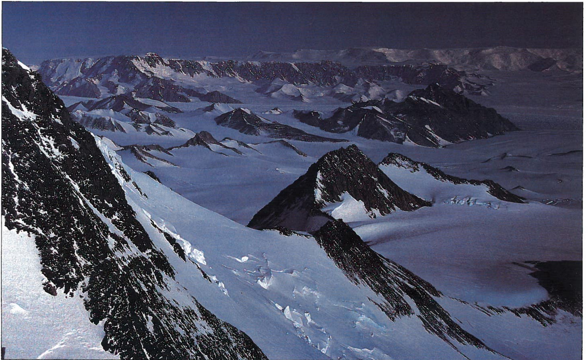
View of the Transantarctic Mountains to the northwest from the summit of Mt. Griffith (3095 m, lat 85°53'S, long 155°30'W). Most of the exposure in the foreground is plutonic rock of the Ross orogen. The dark cliffs of Breyer Mesa in the background are topped by an exhumed part of the mid-Paleozoic Kukri peneplain, formed by erosion following the Ross orogeny. On the skyline is the Rawson Plateau, containing late Paleozoic to Triassic sedimentary rocks of the Beacon Supergroup which overlie the unconformity. Amundsen Glacier flows from left to right in the middle ground of the photo.