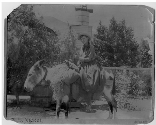
Lou Henry on a family trip to camp. Acton, California, USA, 22 Aug. 1891. Lou really walked all the way; she sat on one of the park burros for fun and was photographed.