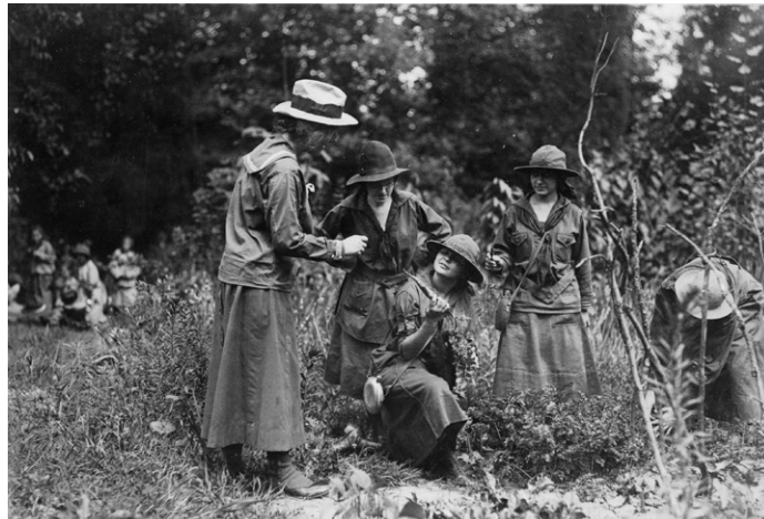
Lou Hoover (standing) led lessons on wartime vegetable gardening, here with some Girl Scouts, circa 1918.

Beginning in 1917, Lou became involved in the Girl Scouts of America. She first accepted an invitation to address the fledgling