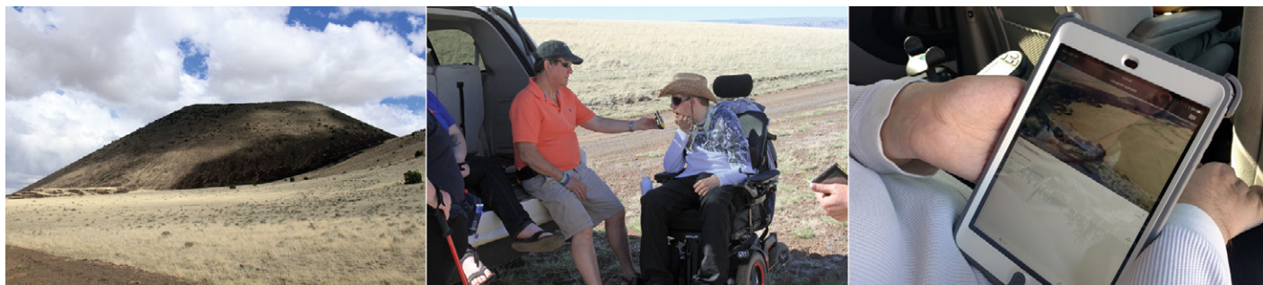
Figure 1. The SP Crater cinder cone that was only accessible to half of the cohort (left), the group that remained at the base used two-way radios (middle) and a Livestream video broadcast (right) to communicate with students at the top of the cinder cone.

This half-day exercise focused on describing and interpreting sedimentary structures