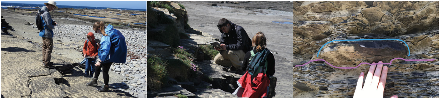
Figure 2. Students at the exposed seaside cliffs near Kilkee (left) using the camera and Skitch application on the iPads (middle) to record and annotate the sedimentary structures and deformation features (right) to share with their peers who did not access this location.

and deformation features in rocks exposed along seaside cliffs near the town of Kilkee (Fig. 2). Most of the features, such as ripple marks, cross-beds, and soft-sediment deformation structures (Martinsen et al., 2008) were viewable by all participants from a paved path along the top of the cliffs. Some smaller-scale features, such as sand volcanoes and fault surfaces, required descending steps to an eroded cliff platform and thus were not accessible to everyone. Students used iPad cameras and the Evernote and Skitch apps to record, sketch, and describe features; remote communications were facilitated with two-way radios. A full group discussion of the exercise occurred indoors later in the evening.